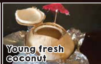
Young fresh coconut