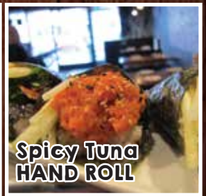
Spicy Tuna HAND ROLL