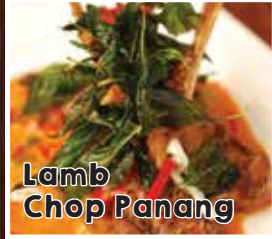
Lamb Chop Panang