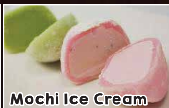
Mochi Ice Cream