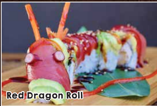
Red Dragon Roll