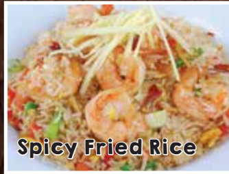
Spicy Fried Rice