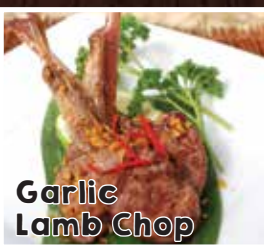
Garlic Lamb Chop