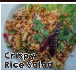
Crispy Rice Salad