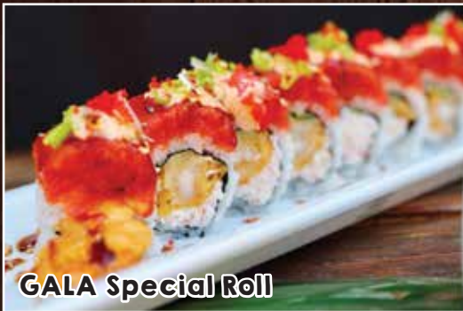
GALA Special Roll