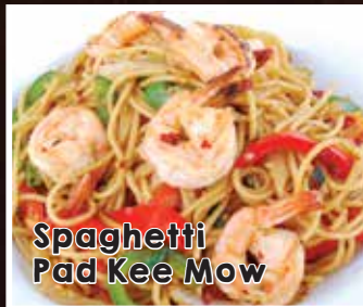
Spaghetti Pad Kee Mow

- egg noodle, Northern-style yellow curry, crispy noodle, red onion, pickled green mustard